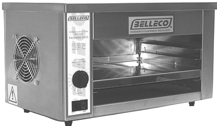
MODEL JW1 OVEN SHOWN