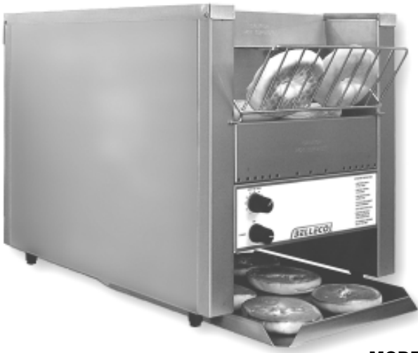
MODEL JT2-B SHOWN