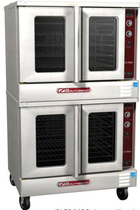
(SLES/20SC shown with optional casters)

SLES/20SC, SLES/20CCH SLEB/20SC, SLEB/20CCH