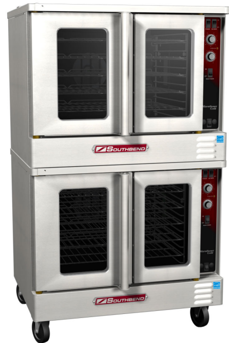
(GS/25SC shown with optional casters)