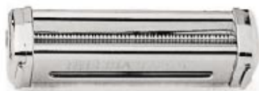
PCRM 2201 1.5mm - 1/16"