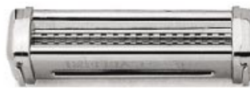
PCRM 2205 12mm - 7/16"