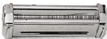
PCRM 2202 2mm - 3/32"