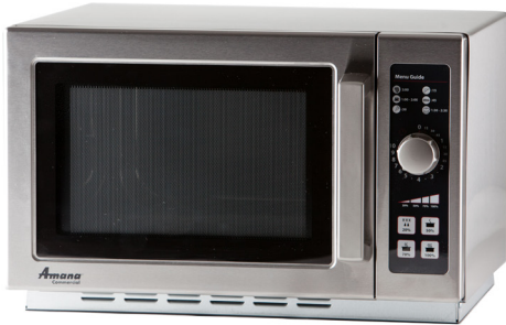
Model RCS10DSE shown